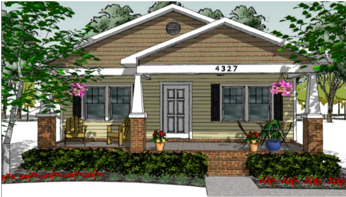
Meadows at Plato Price