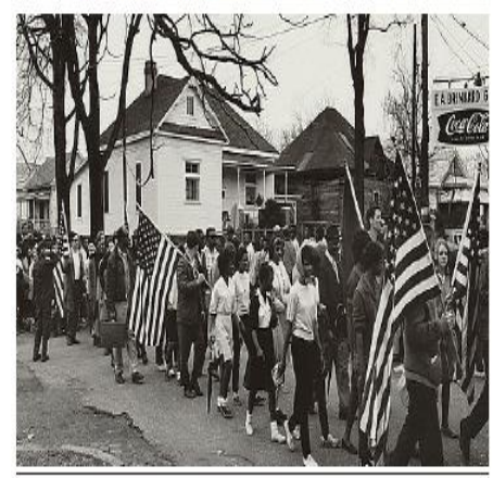
Civil Rights march from Selma to Montgomery, Alabama in 1965

Contact gkeesler@firstpres-charlotte.org for more information.