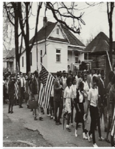
Civil Rights march from Selma to Montgomery, Alabama in 1965

Contact gkeesler@firstpres-charlotte.org for more information.