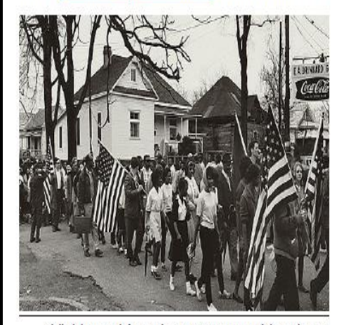
Civil Rights march from Selma to Montgomery, Alabama in 1965

Contact gkeesler@firstpres-charlotte.org for more information.