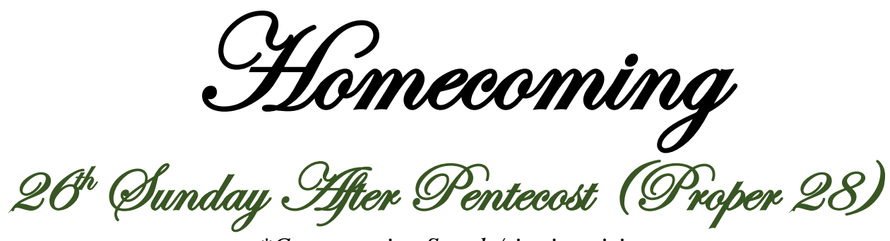
*Congregation Stands/rise in spirit