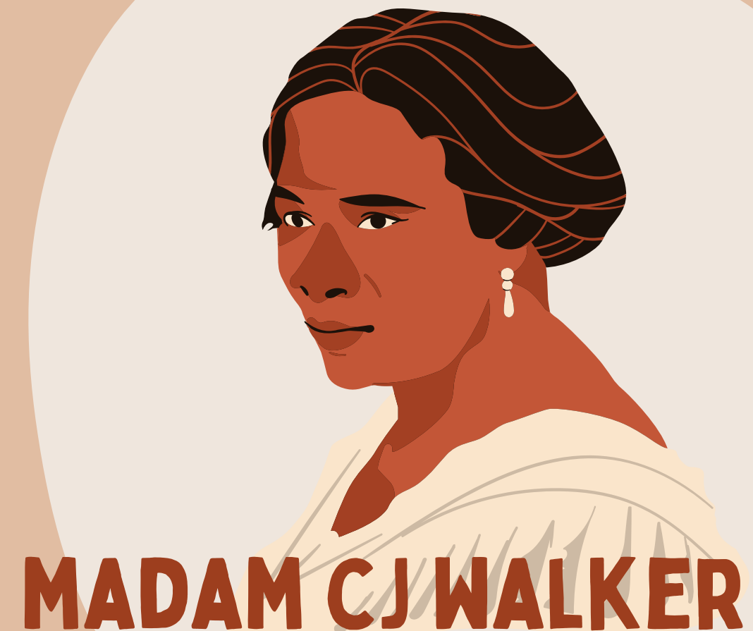
MADAM CJ WALKER

Reflect “Black Excellence” by rocking your favorite HBCU, fraternity or sorority attire.